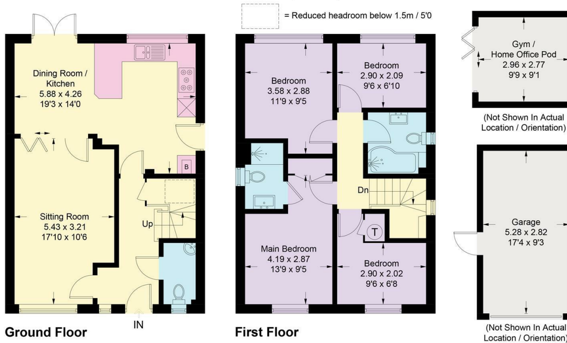
Illustration for identification purposes only, measurements are approximate, not to scale. Fourlabs.co © (ID1271127)